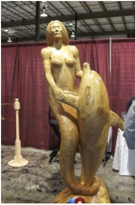
Yes - some of the carvings were overwhelming