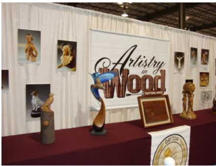
Entry into Dayton Show at Exposition Center