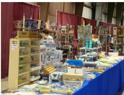
Cedar Bird Shoppe setting up. They will be at Charlotte in February, 2013