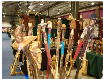
Canes and Hiking sticks at Dayton show