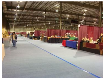
Dayton - one word - HUGE - LARGEST IN THE USA.