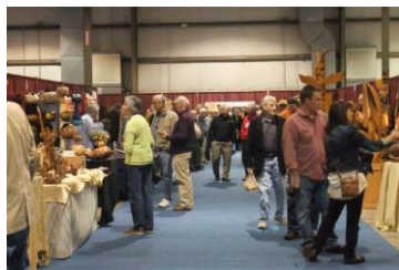
4645 visitors for Dayton's two day show. Admission: $7/10