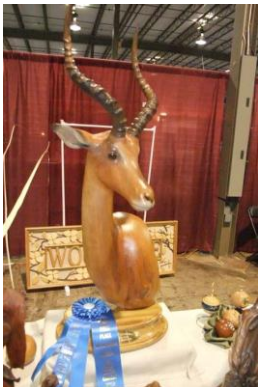
Dayton - 2012