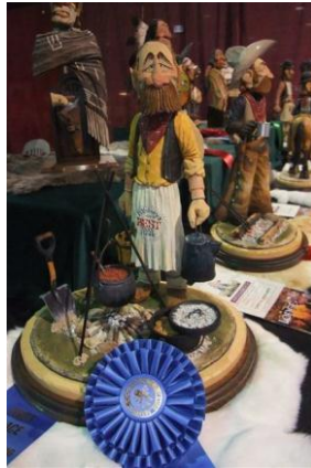
Dayton - 2012 - Old West