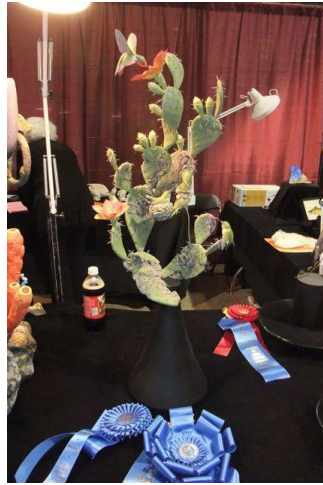
Best of Show - Dayton. Huge. $750 for first prize.