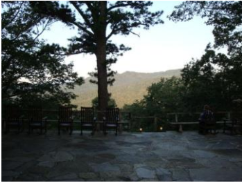
Scene from the patio looking toward Mount Mitchell.