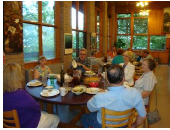
Another day - another meal!