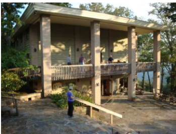
South Lodge where CWCC members had lodging.