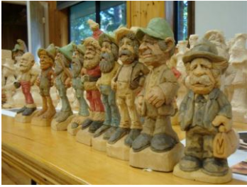
Several of the options we had to carve with Mitch.