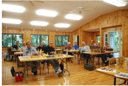
Wildacres carving studio with CWCC carvers. Great lighting and facilities.