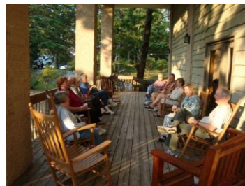
Ahh! The evening fellowship after we finished carving and the ladies had finished spending money!