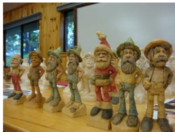
Mitch demonstrating the finishing touches to carvings.