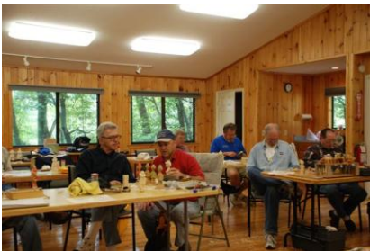
Total concentration by group.