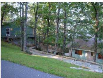
Studios on the grounds - Carving studio at right and Gem studio on left.