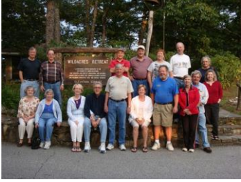
CWCC members gathering before the evening meal on the Retreat grounds.