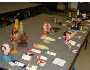
More of the carvings by members.