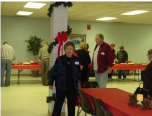
Early arrivals at the Christmas Party.