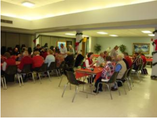
Some of the 70 attendees at the Party.