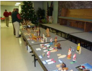
Some of the 140 carvings which members displayed.